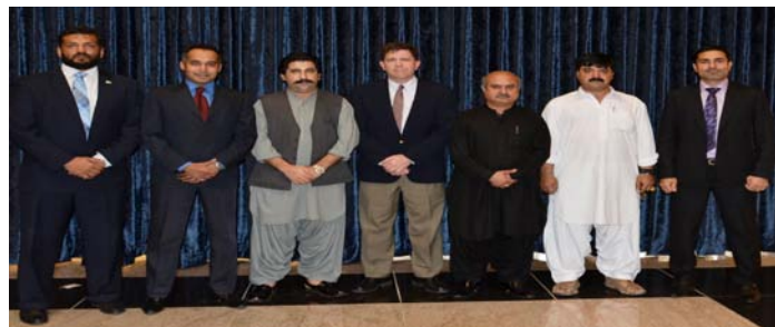
Meeting with US Consulate General Karachi