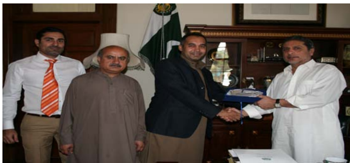
iLearn team with Honourable Governor and Information Minister Balochistan